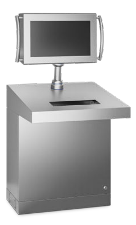
Custom Consoles with an additional Support Arm System and HMI.