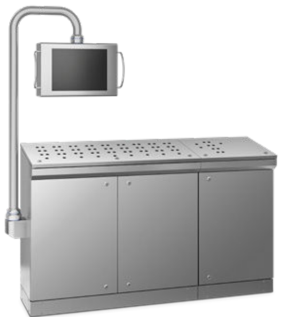
Custom Consoles with cut-outs for auxiliary equipment, incorporated with an additional Support Arm System and HMI.