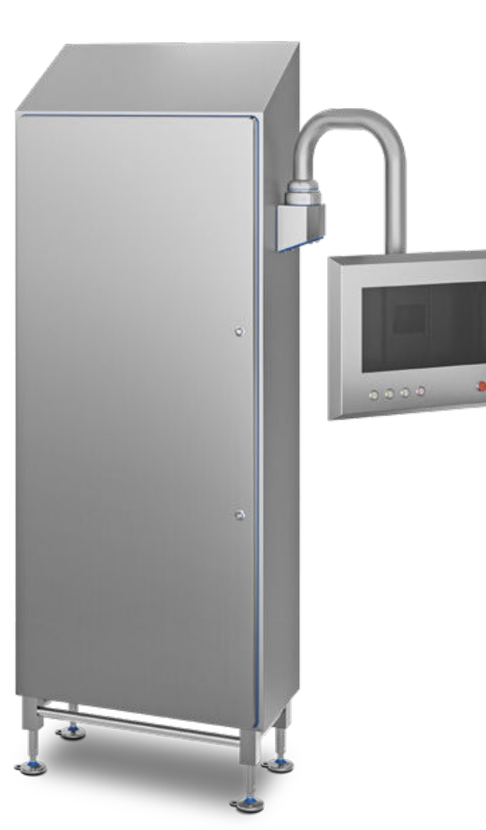
Custom Hygienic Enclosures incorporated with an additional Support Arm System, HMI with Auxiliary control cut outs.